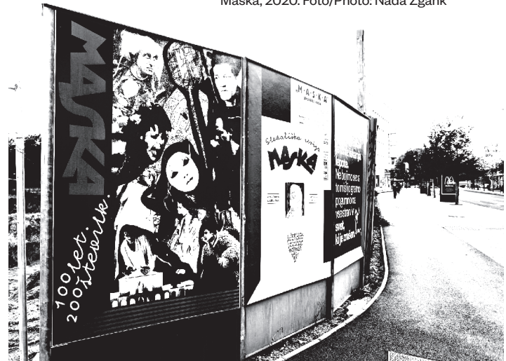
Razstava Maska .. 100 let. 200 številka na Tam Tam plakatnih mestih / Exhibition Maska .. 100 Years. 200 Issues at Tam Tam poster locations. Maska, 2020.

The programme of The New Post Office is curated by: Urška Brodar, Goran Injac and Janez Janša.