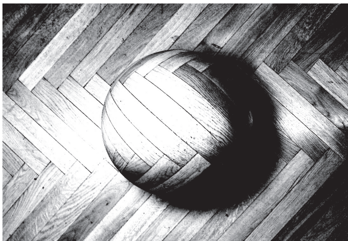
Mateja Bučar: Nad parketom/Parquet Ball, 2020.

Vstop v Zlato dvorano Narodne galerije Ljubljana, kamor je delo umeščeno, je prost in možen kadarkoli v času dogajanja. Vse vljudno prosimo, da upoštevajo potrebno disciplino glede distance med gledalkami in gledalci ter plesalkami in plesalci.